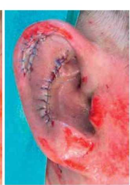
Depending on the site, it is not necessary to sacrifice much tissue also after a third grade trauma. Here at the ear excision and secondary seam are enough