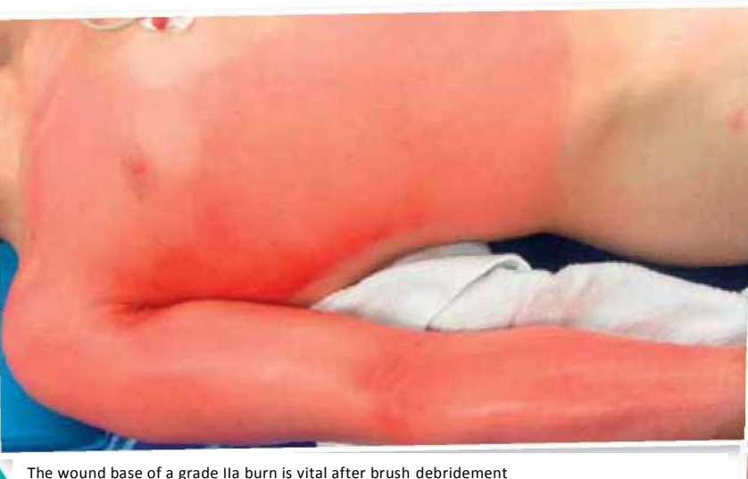
The wound base of a grade IIa burn is vital after brush debridement

that there are many white areas after brush debridement, i.e. In the sense of a grade IIb till III burn - a further surgical therapy is required.